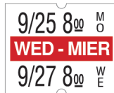
Actual Size of Label