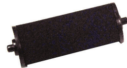
Ink Roller... 110881