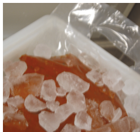
Safe to freeze