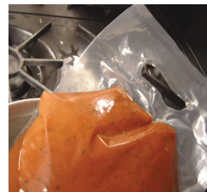
Safe to boil